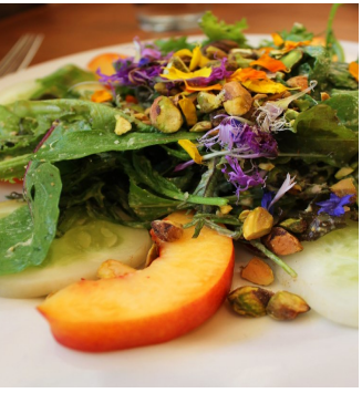
2. Edible flower garnish