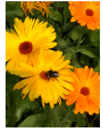
8. Scotch Marigold

Easy to grow, self seeding if allowed, in any reasonable soil, enjoying full sun.