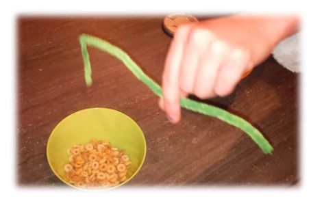
Step 1. Bend one end of the pipe cleaner approx. 5cm from end to stop Cheerio hoops from sliding off.