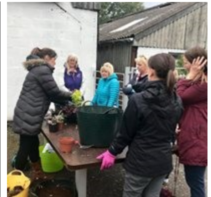
Theory and demo session

Trellis supported the charity by delivering a gardening workshop entitled 'Gardening Know-How for Year Round Interest Planters', free to those who could attend, its primary aim being to engage with potential garden maintenance volunteers as well as give them the skills and confidence to volunteer their help in the garden maintenance required.