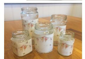
Step 6 Get gifting!