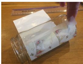
Step 4 Roll the paper