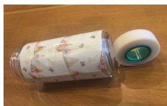
Step 4 Secure paper tightly

Step 4 Using double sided tape, secure paper firmly to jar trying to have patterns match up if possible.