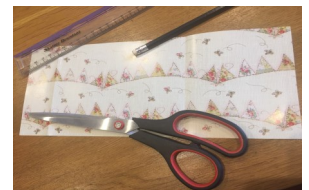
Step 3 Cut to size

Step 3 Mark these measurements onto the paper. Draw and cut out the resulting rectangular shape(s). Be careful of choosing heavily patterned paper as the pattern might not 'match up'.