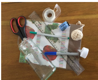
Step 1 Gather the ingredients

Step 1 Have all items required to hand. If making a collection of lanterns, measure all the jars that you would like to cover with paper. Ensure that a tealight will fit inside any smaller jars before decorating!