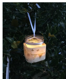
Step 5 Make a looped hanger

Step 5 If required, tie ribbon/string/fine wire around the neck of the jar and secure tightly to make a loop from which to hang the lantern. Place a battery operated tea light inside the jar, sit back, enjoy the natural light fade and your lantern come to life!