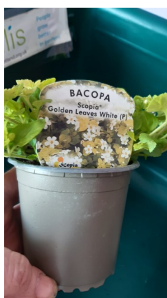
Spiller plant 1