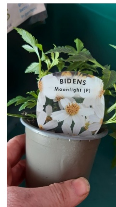
Spiller plant 3

For more gardening activity ideas visit www.trellisscotland.org.uk/activities Need help, advice, or further information? visit our website or call 01738 624348