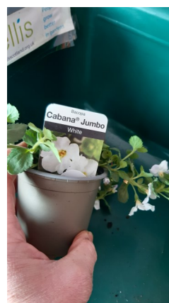
Spiller plant 2