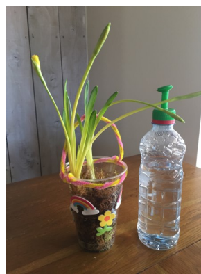
Step 4 Water to cover the roots only