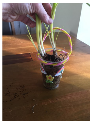
Step 3 Layer up moss and bulbs

Step 3 Fill vase a fifth full with moss. Place a bulb, (or a few) roots first, on top of the moss bed. Firmly pack more moss around the bulb, leaving the bulb neck exposed.