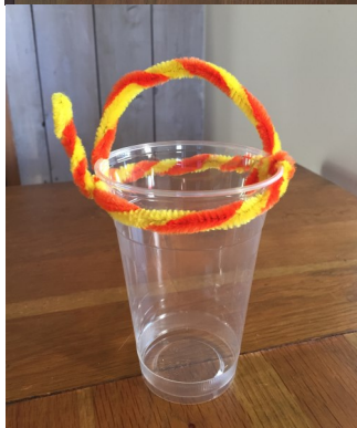
Step 1 Decorate the 'vase'

Step 3 Fill vase a fifth full with moss. Place a bulb, (or a few) roots first, on top of the moss bed. Firmly pack more moss around the bulb, leaving the bulb neck exposed.